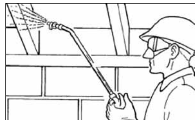
Treating the sill, band joist, subfloor and floor joists in a crawl space or basement structure.

Apply PenaShield only to bare wood or to wood surfaces where an intact water-repellent barrier is not present. PenaShield is a ready-to-use product. This product may be brush applied directly from the container or applied with a low-pressure garden-type sprayer. Small wooden items may also be