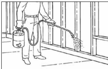
Treating an exterior wall and sheathing on a slab structure.